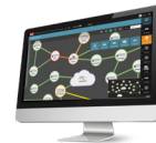
RADview Management and Domain Orchestration