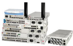
ETX-2/ETX-2i 1/10/25/100G EADs, LTE/5G and Broadband Options