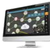
RADview Management and Domain Orchestration