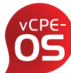
vCPE-OS Open Carrier-Class operating system