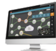
RADview Management and Domain Orchestration