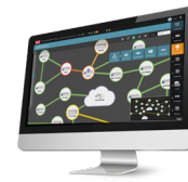
RADview Management and Domain Orchestration