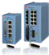
SecFlow SCADA Secure Switch/Routers with Edge Computing