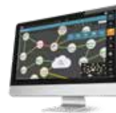
RADview Management and Domain Orchestration