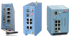
SecFlow Industrial IoT Gateway with Edge Computing