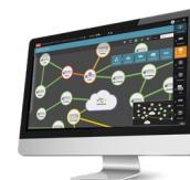
RADview Management and Domain Orchestration