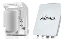
Ceragon/Airmux Wireless Transport Platform