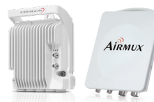
Ceragon/Airmux Wireless Transport Platform