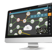
RADview Management and Domain Orchestration