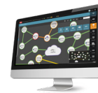
RADview Management and Domain Orchestration