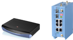
ETX-1p, SecFlow-1p pCPE Platforms