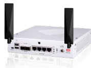
ETX-2v uCPE Platforms