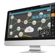
RADview Management and Domain Orchestration