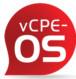
vCPE-OS Open Carrier-Class Operating System