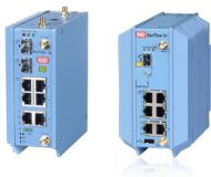
SecFlow Industrial IoT Gateway with Edge Computing