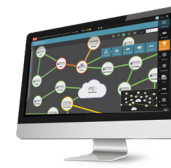
RADview Management and Domain Orchestration