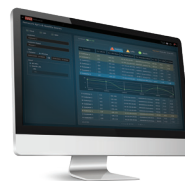
RADinsight LAN to Cloud Performance Monitoring